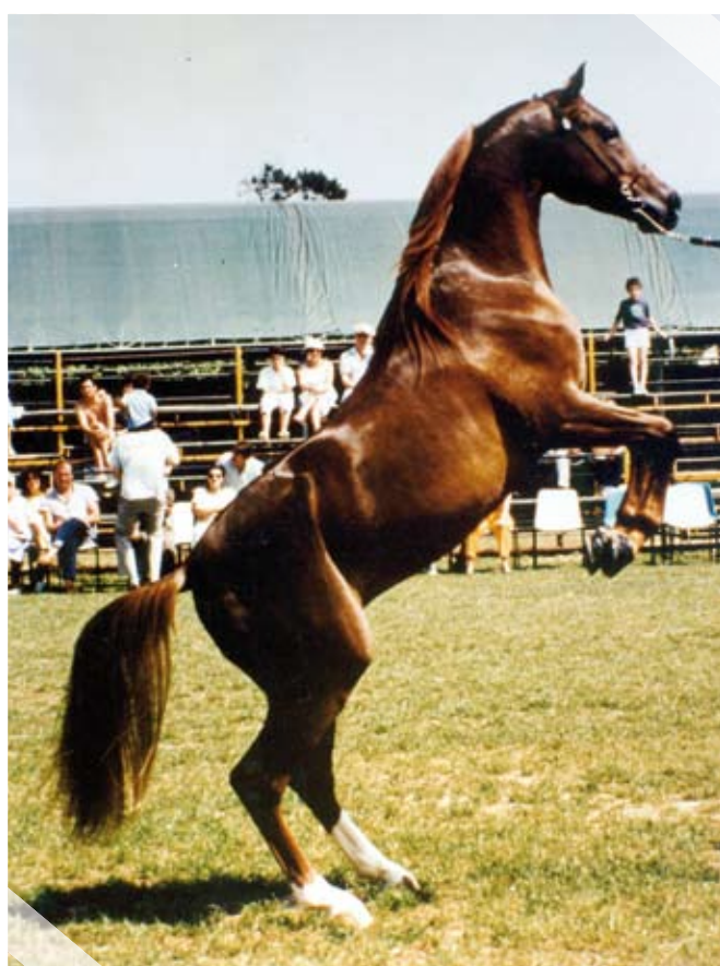
ABHA HARIM (Abha Nejeb x Abha Hamir)