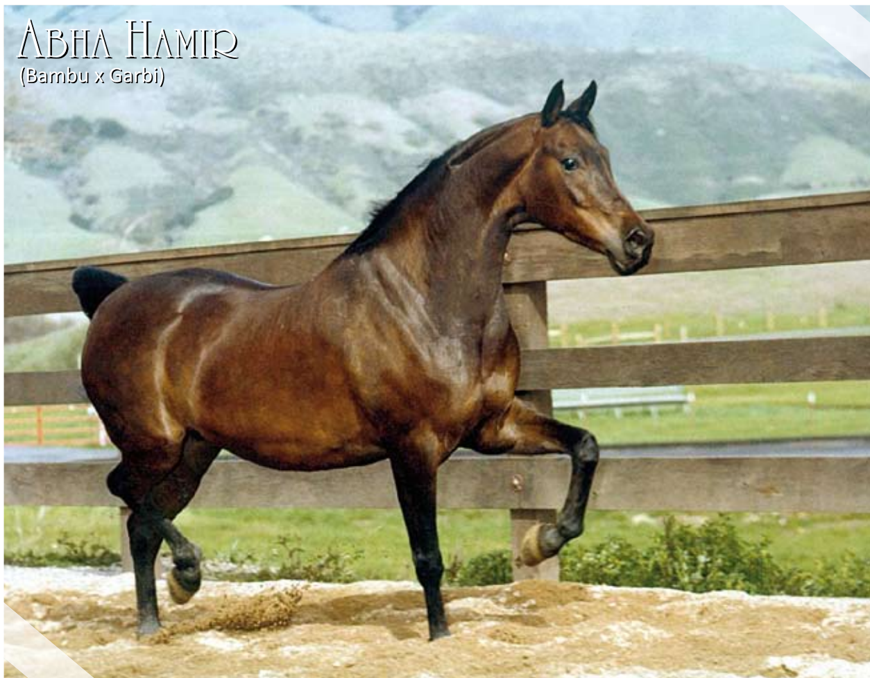
ABHA HAMIR (Bambu x Garbi)