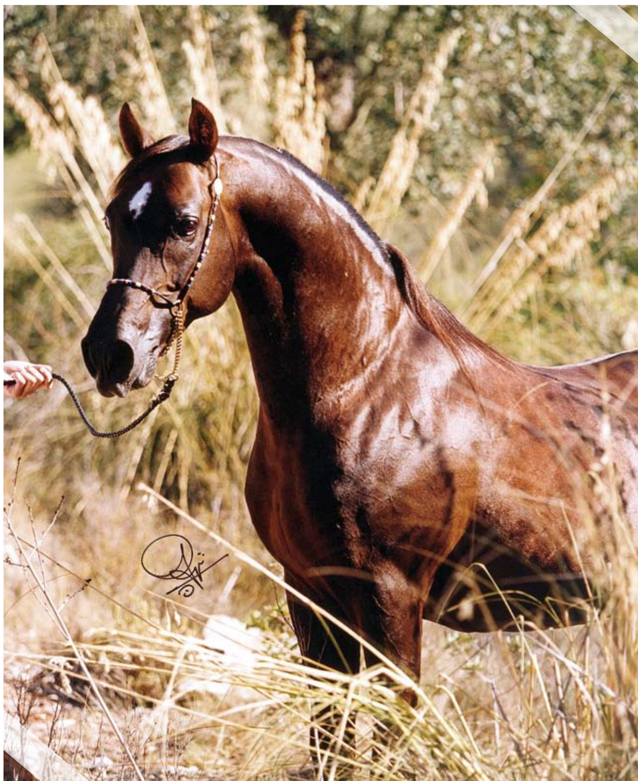
ABHA HAMIR (Abha Neheb x Abha Hamir)