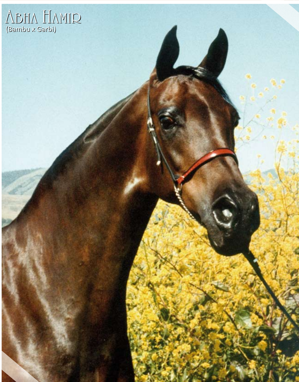
ABHA HAMIR (Bambu x Garbi)